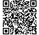
Link to Engage Website

As of March 6th, it is our understanding that city staff will give a presentation on this project at the Work Session on March 14th and there will be a Public Hearing on March 28th.